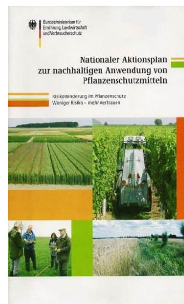
Figure 2 The national pesticide action plan in Germany focuses on reducing the risk associated with and intensity of use of plant protection products.