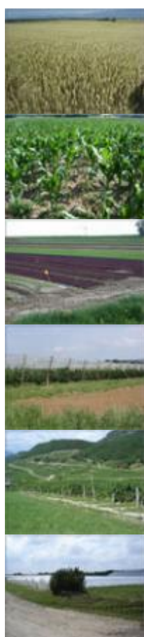
Winter wheat based rotations

PURE will provide IPM solutions and a practical toolbox for their implementation in key European farming systems (annual arable and vegetable, perennial, and protected crops) in which reduction of pesticide use and better control of pests will have major effects. The six farming systems represent 66% of the total crop production area and 87% of the pesticide consumption in Europe. The systems are: